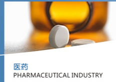
医药 PHARMACEUTICAL INDUSTRY